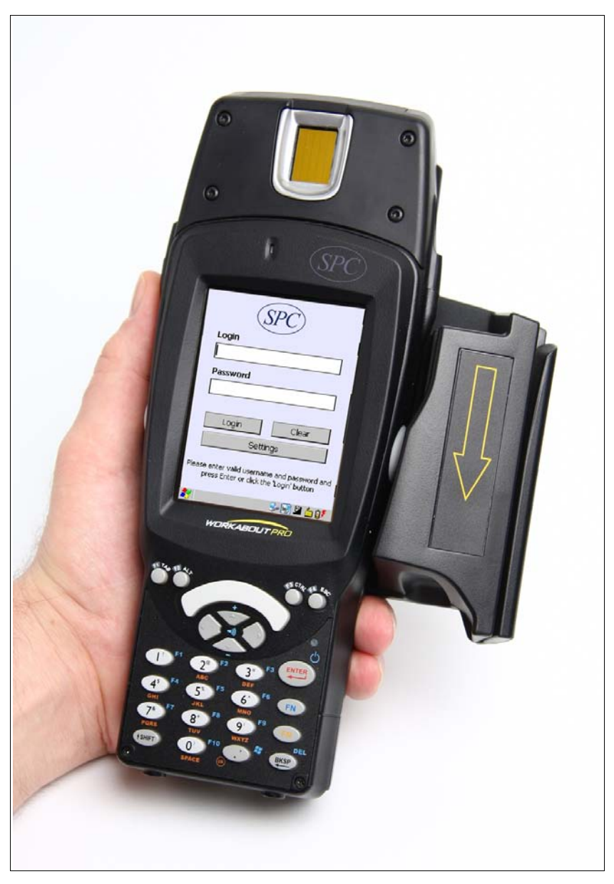
SPC Mobile Document Reader MDR-1

MDR-1 can be delivered alternatively with Software Development Kit [SDK], enabling customers to develop their own customized application..